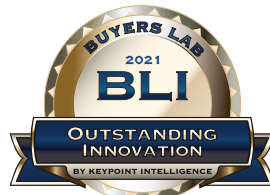
Xerox Adaptive CMYK+ Kits

Take automation to the extreme with click-simple automated color quality with full spectrum color management hardware and software tools. An inline X-Rite® Spectrophotometer with Color Profiler Suite working with Automated Color Quality Suite (ACQS) takes the variability out of the color equation and reduces time-consuming manual color maintenance and operator error.