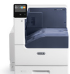
Xerox® VersaLink® C7000 Color Printer