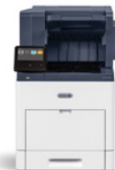
Xerox® VersaLink® B610 Printer