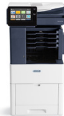
Xerox® VersaLink® C605 Color Multifunction Printer