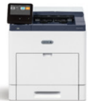
Xerox® VersaLink® B600 Printer