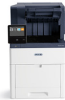
Xerox® VersaLink® C600 Color Printer