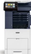
Xerox® VersaLink® B615 Multifunction Printer