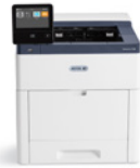
Xerox® VersaLink® C500 Color Printer