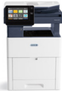
Xerox® VersaLink® C505 Color Multifunction Printer