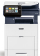
Xerox® VersaLink® B605 Multifunction Printer