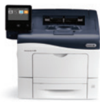
Xerox® VersaLink® C400 Color Printer