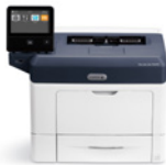
Xerox® VersaLink® B400 Printer