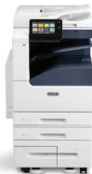
Xerox® VersaLink® C7020/C7025/C7030 Color Multifunction Printer