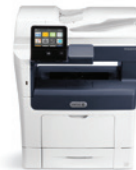
Xerox® VersaLink® B405 Multifunction Printer