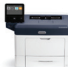
Xerox® VersaLink® B400 Printer