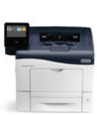
Xerox® VersaLink® C400 Color Printer